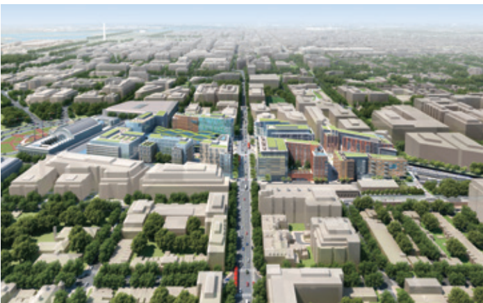
Connecting the areas east and west of the rail yard visually and physically was a central feature of the 2012 vision.

In 2012, Akridge created an initial concept for Burnham Place, developed in coordination with Amtrak's Union Station Master Plan. This concept established the vision for Burnham Place which will inform the master planning process now underway.