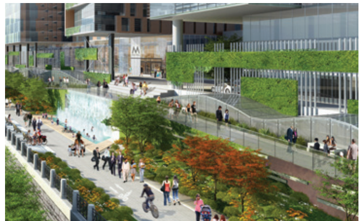
Parks and plazas of varying sizes, functions, and configurations were key elements of the 2012 vision.