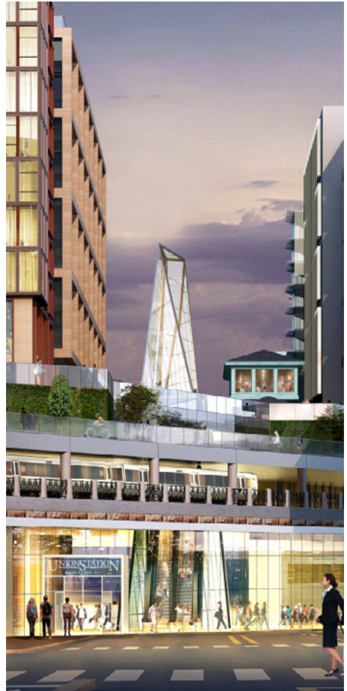
The 2012 vision emphasized the importance of improved pedestrian connections between H Street, NoMa, Capitol Hill, and Union Station.